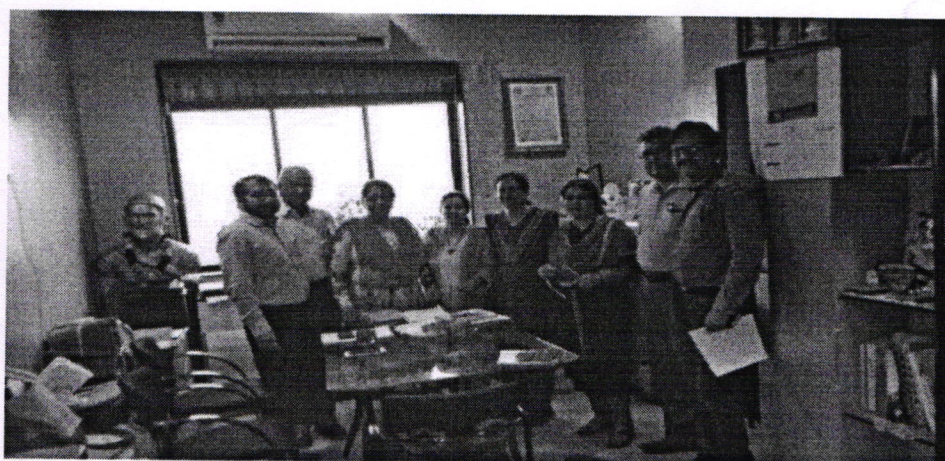
The Collaborating Team

The MOU was signed for two years for the exchange of knowledge and placement for our students.