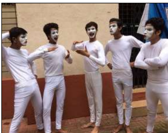
Rehearsal for Mime at Youth Festival