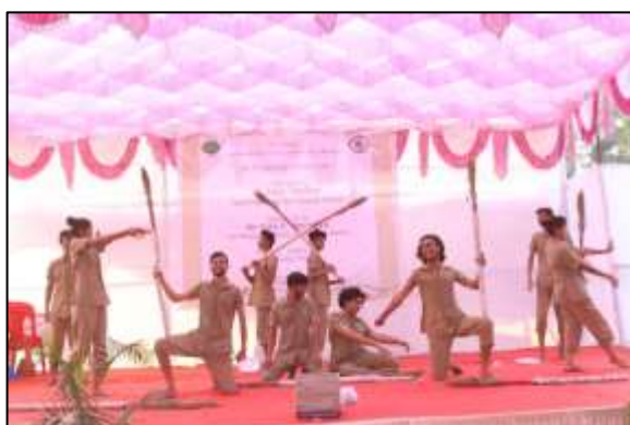
Students' Performance during the Annual Day