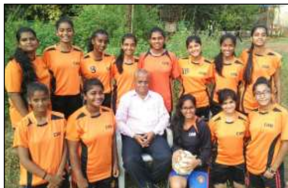
College Football Team that Won the District Level Tournament