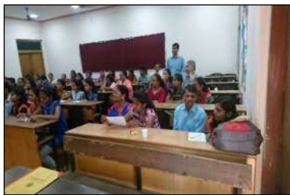
Students & Parents During the Parents-Teachers Meeting