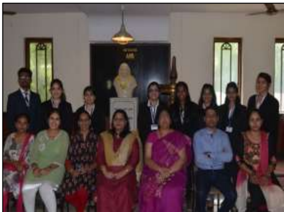
The Team of the International Economics Convention