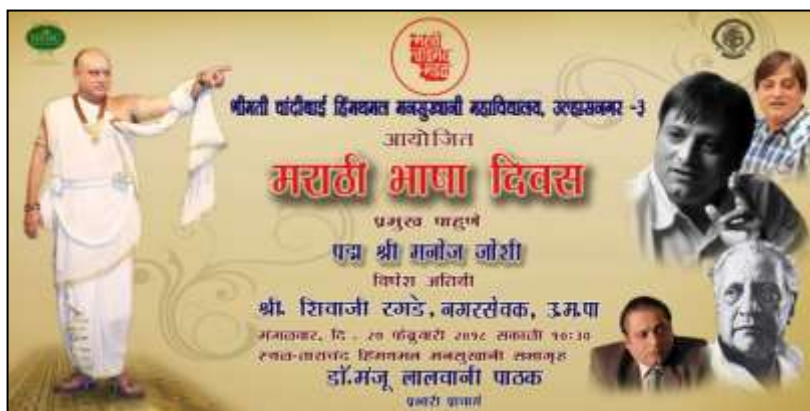
Banner of the Marathi Bhasha Diwas Celebration with Padmashri Manoj Joshi being the Chief Guest