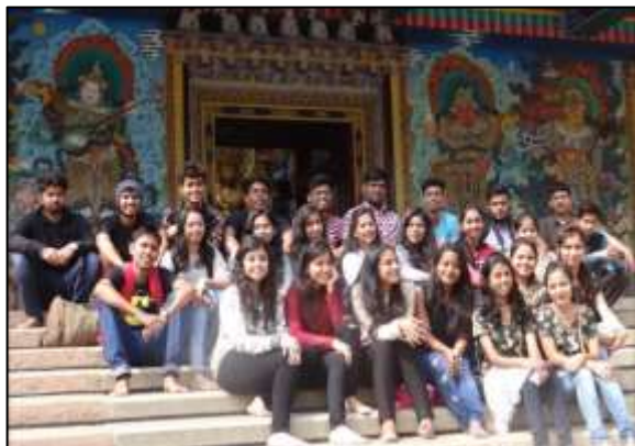
TYBSc Students during the Study Tour in Karnataka