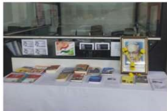
Remembering Dr. S. R. Ranganathan