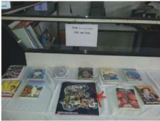
10 April celebration of Sindhi Divas