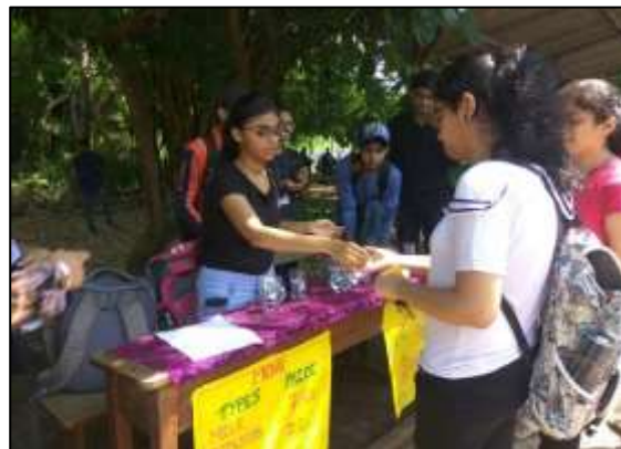
Students involved in the Extension Work Project, 'Annapoorna Yojana'