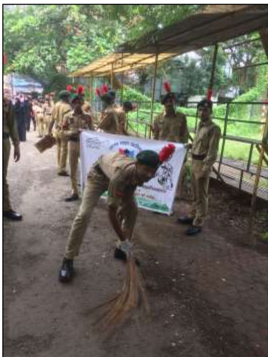
NCC Cadets Cleaning the College Campus Area