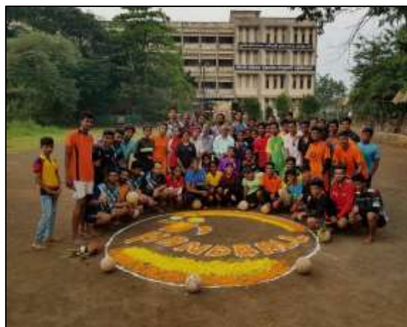
A Moment During the Dasara Celebrations