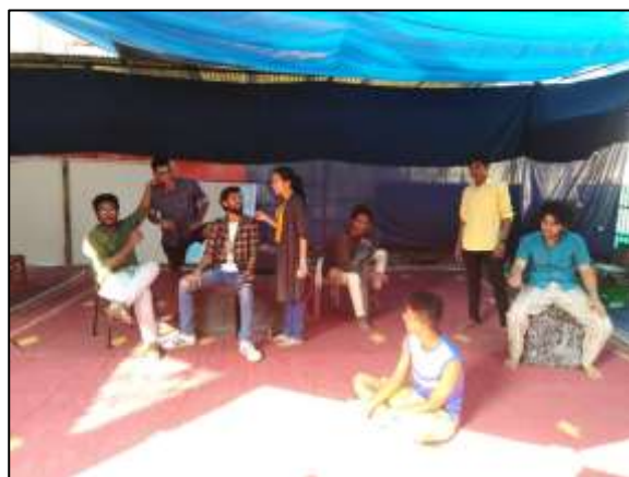
Rehearsal for Skit Competition at Youth Festival