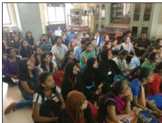
Students keenly attending to lecture on Careers in Industrial Psychology