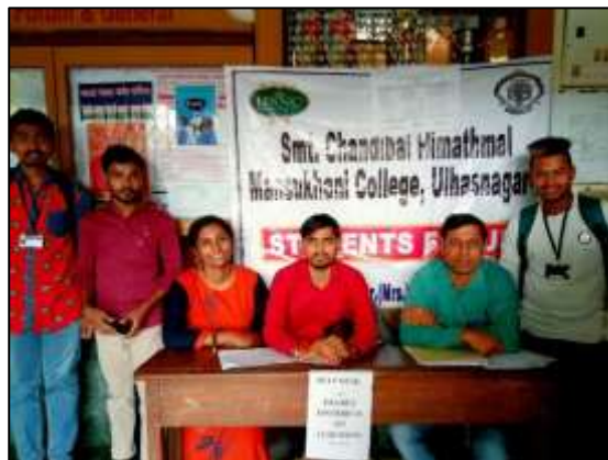
Students Forum Team Assisting the Degree Distribution Ceremony