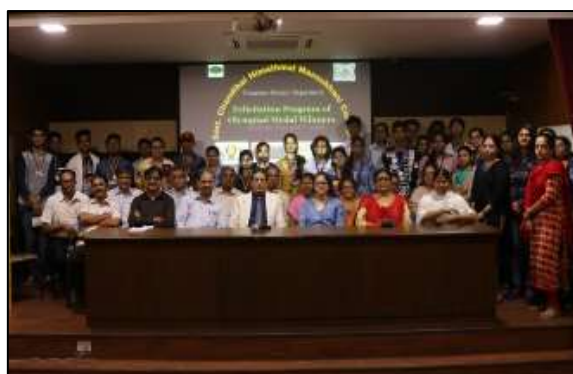
Felicitation of the Olympiad Winners