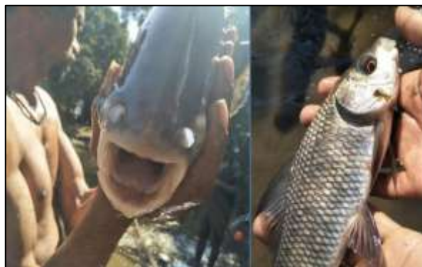
Demonstrations of Fish & Fish Harvesting during the Field Visit to Saguna Bag