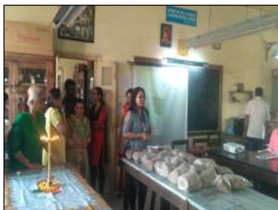
A Moment Clicked During Science Exhibition