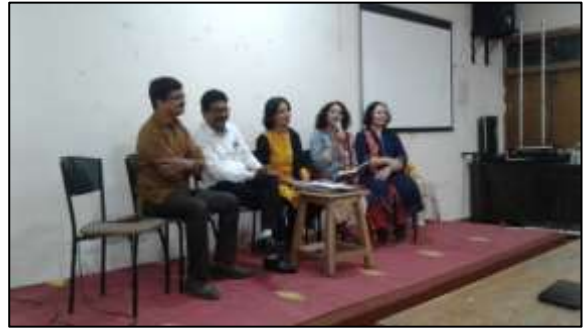
Dignitaries during the Marathi Bhasha Pandharwada