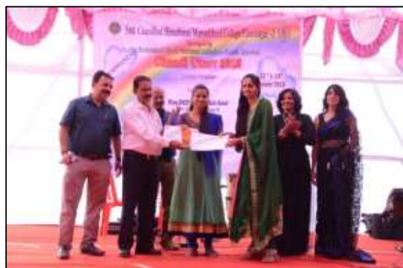
Certificate Distribution during the Chandi Utsav