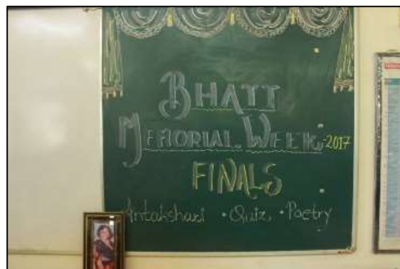
Activities during the Bhatt Memorial Week