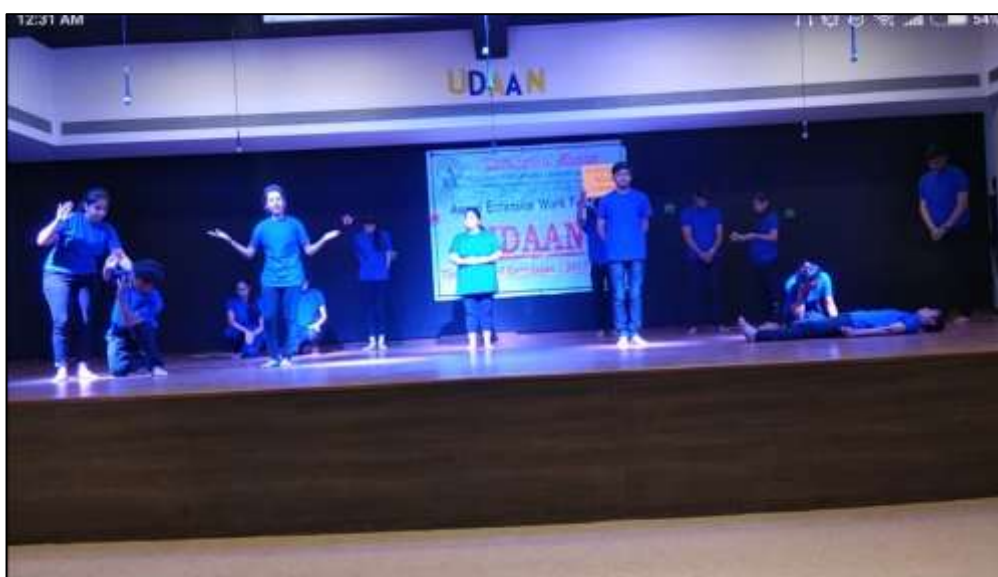
Students Performing in 'Udaan', the Annual Extension Work Festival