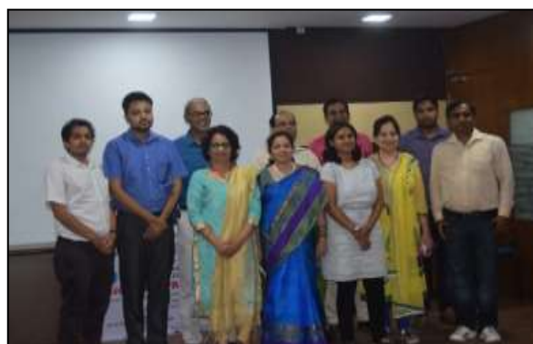
Resource Persons & the Faculty of the Department during the Event - BIOENTREPRENEUR 2018