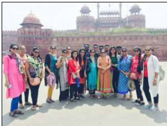
A Moment during the Field Visit to Delhi with the Red Fort at the Backdrop