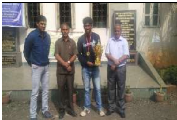
The student who Won the Trophy in Power Lifting in the West Zone Tournament