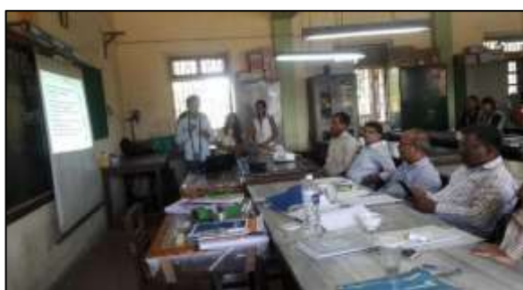
Research Project Presentations of TYBSc Students