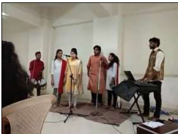
Students Performing Indian Group Song During Youth Festival