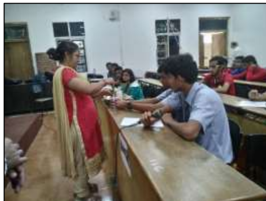
Workshop on Mushroom Cultivation Conducted with Department of Botany