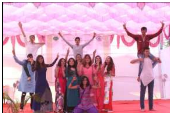
Students' Performance during the Annual Day