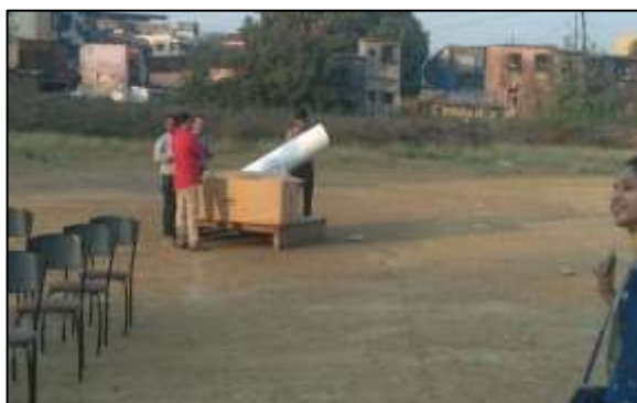
Sky Watch Event in the College Campus Organized with Department of Physics