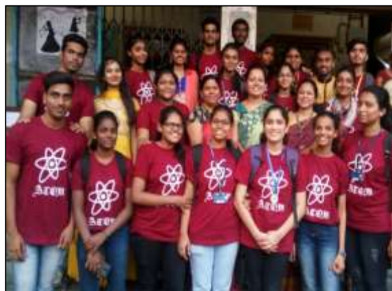
Student Volunteers of ChemFest