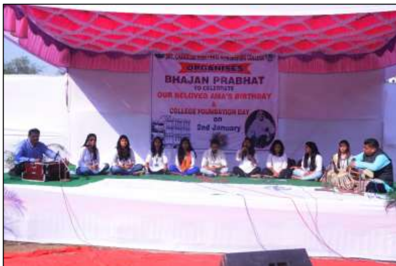
Students Singing Bhajan