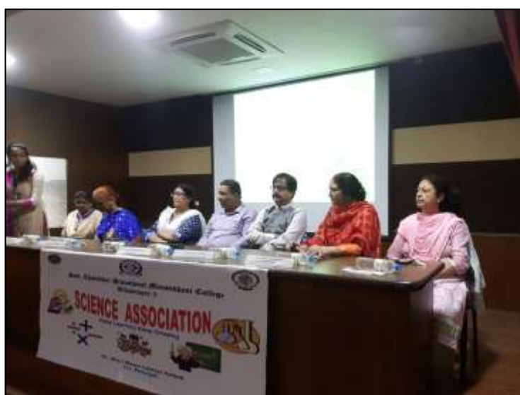
Inauguration of Science Exhibition