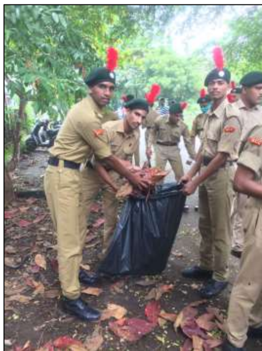
NCC Cadets Collecting the Garbage for Eco-friendly Dumping