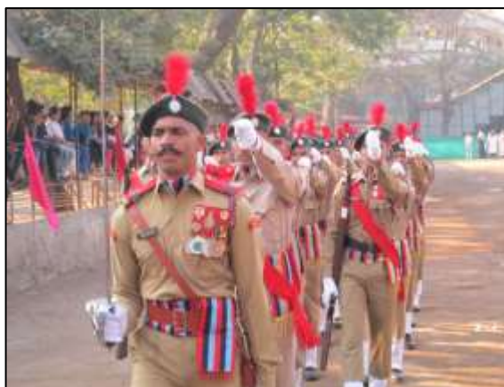
NCC Cadets Performing the March During the Republic Day