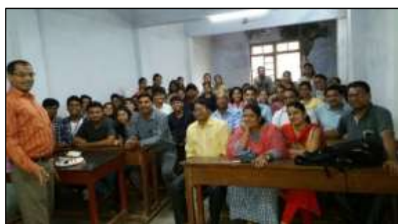
Get-together of TYBSc Students & Faculty