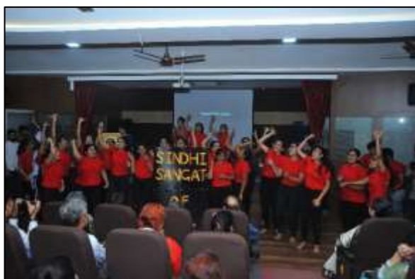
Students Performing Sindhi Skit During “Sindhyat Ji Surhan”