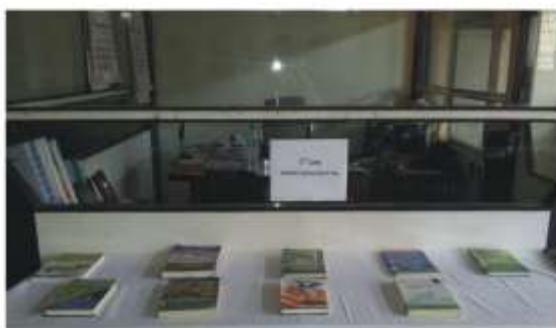
World Environment Day