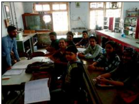
Lecture Series under Career Guidance Program