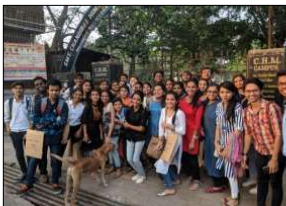
Group of students who visited Pearl Academy