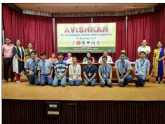
A Moment Clicked During Avishkar, an Inter- Collegiate Science Quiz Competition