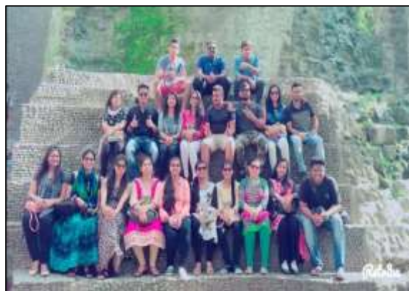
A Moment during the Field Visit to Chandigarh