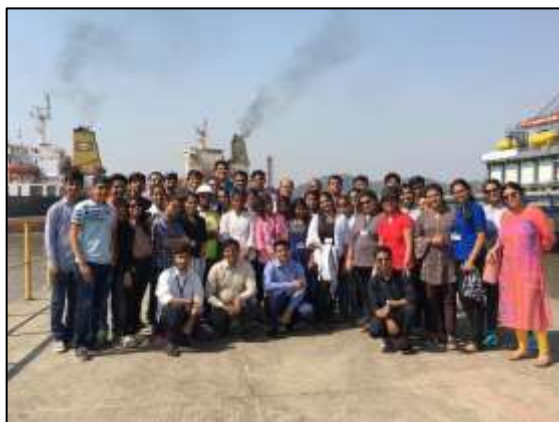
Experiential Learning – Industrial Visit at JNPT organized by the Department of Management Studies in association with the Department of Accountancy