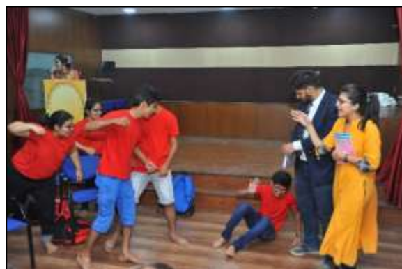
Students Performing Sindhi Skit During “Sindhyat Ji Surhan”