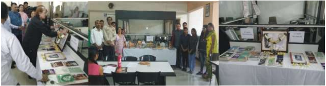
27 February celebration of Marathi Bhasha Divas