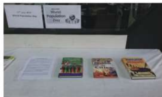
World Population Day