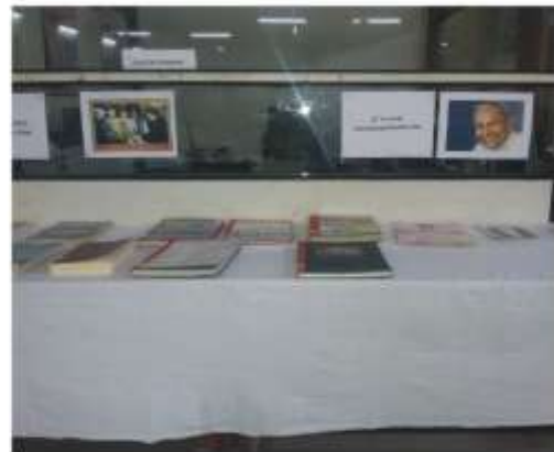
Meatless day Dada Vaswani Birthday