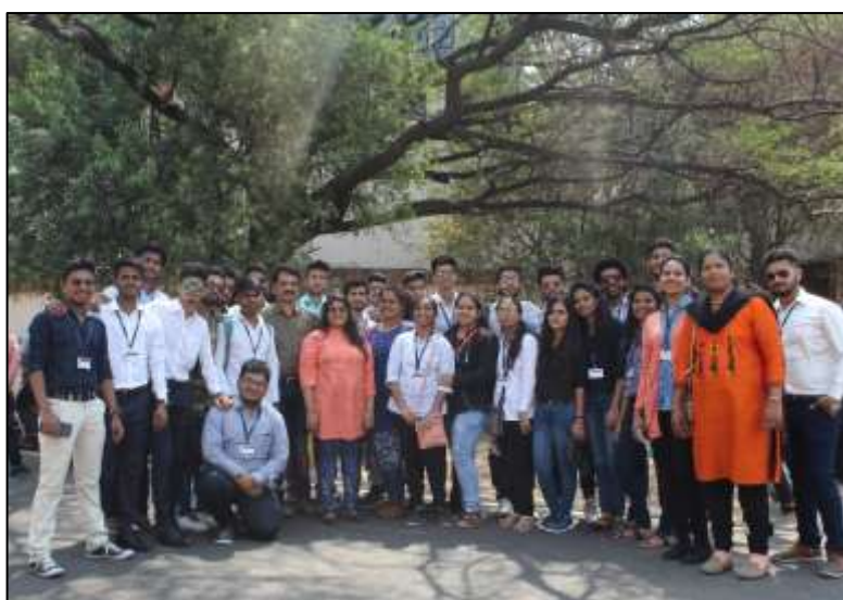
Visit to the STPI Hyderabad