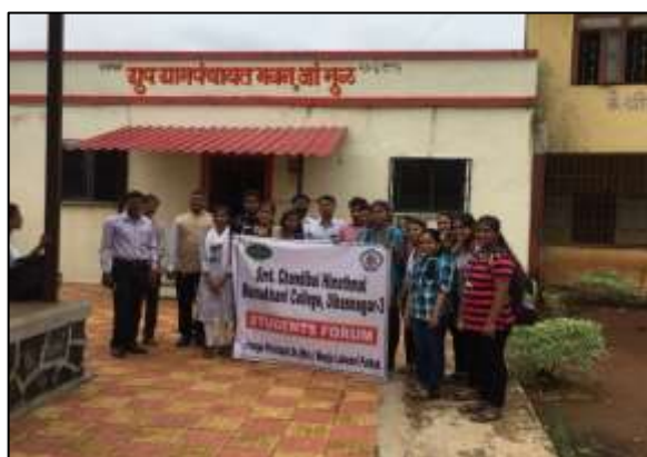
Team of the Student Forum & NSS Conducting the conducted Health and Economic Awareness Survey at Vasat Village, Ambernath