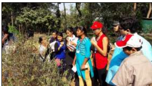
Field Guide Explaining the Ecosystem Wonders in the Maharashtra Nature Park to the Students and Faculty