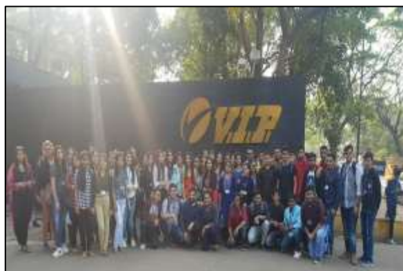
Experiential Learning – Industrial Visit at – VIP Bags, Nasik organized by the Department of Management Studies