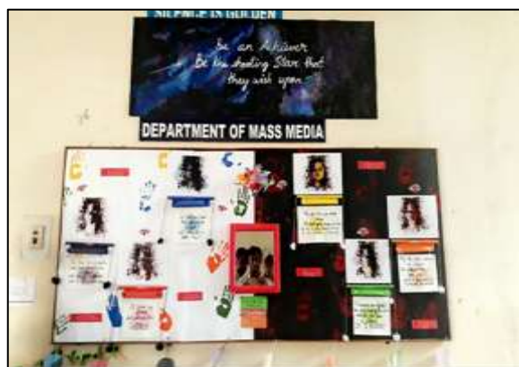
A Wallpaper put up by the students