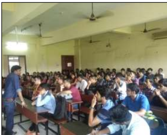
Seminar on “Network Security” by ATS Technologies (Microsoft Solution Partner)