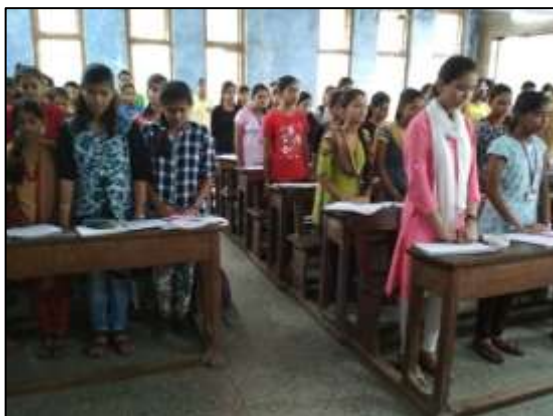
Students Following Silence During the Moment of Calm