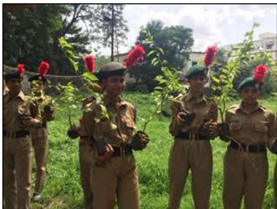
NCC Cadets Holding Saplings to be Planted in the College Campus During the Tree Plantation Activity