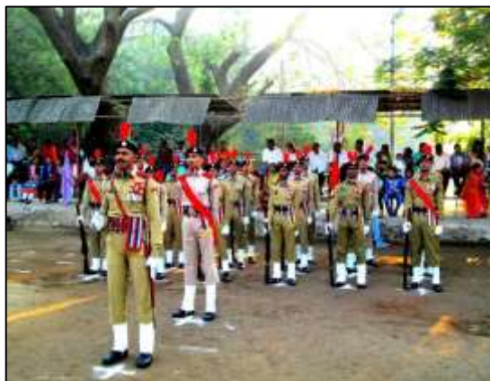
NCC Cadets during the Flag-hoisting on Independence Day