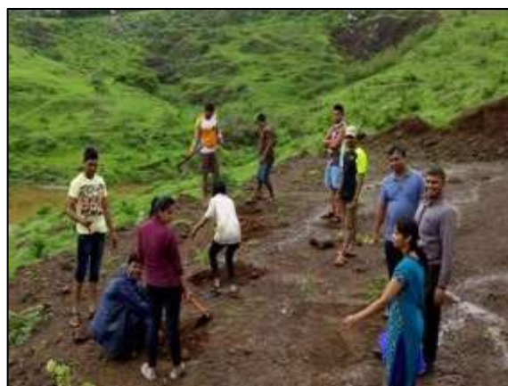
NSS Program Officers Monitoring Students During the Tree Plantation Activity