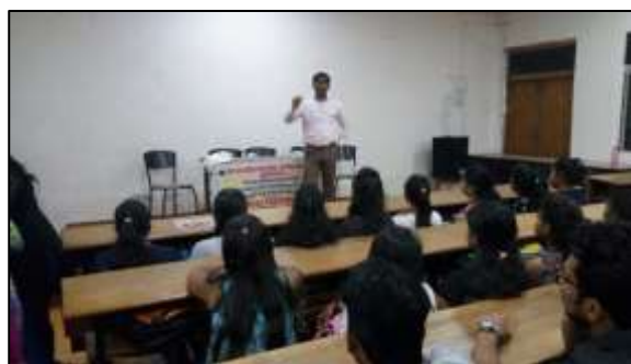
A Moment During Training Workshop on Soft Skills