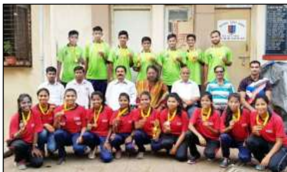
College Ball-Badminton Teams that Won Silver & Bronze Medals at the University Level