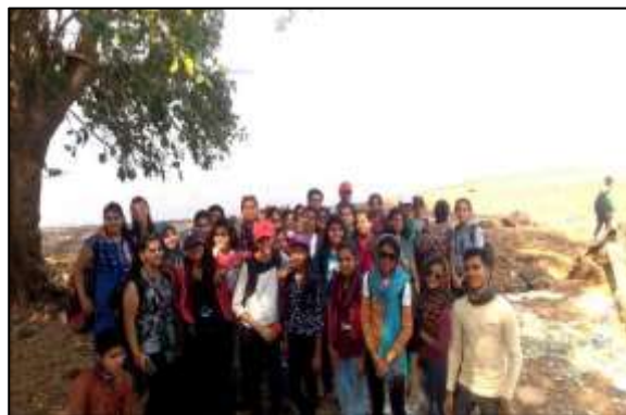
FYBSc Students during the Visit to Tansa Wildlife Sanctuary