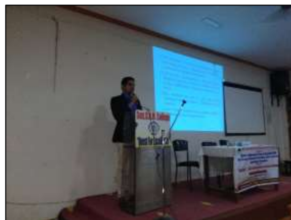
Resource Person Guiding Students During "Lakshya-2018"