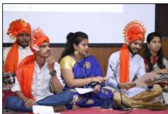
Students Performing During the MVM Activities