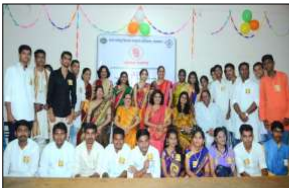
A Moment During the Inauguration