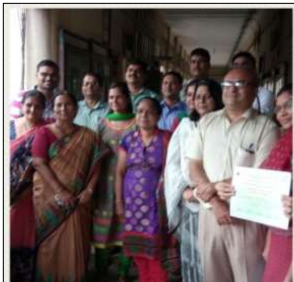
A Moment During the 'Teacher Training Programme' for School Teachers