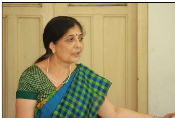
Resource Person during the Bhatt Memorial Week