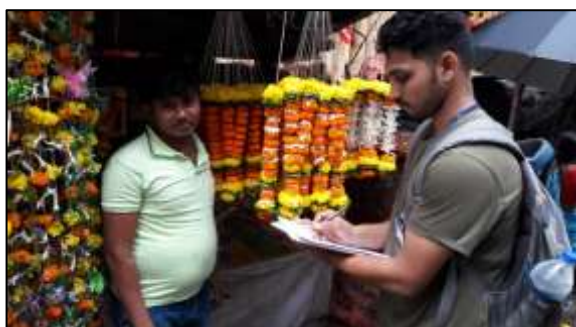
TYBA Student Interviewing Flower Sellers in Kalyan as a part of the Research Project