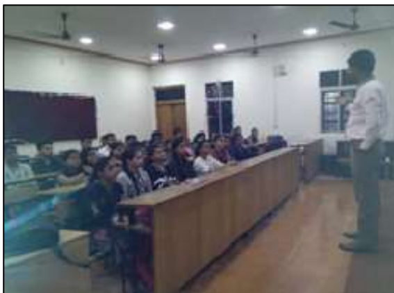
Career Guidance Workshop