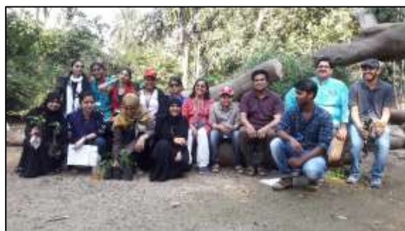
Students and Faculty Enjoying Moments of Joy after a Long Walk in the Maharashtra Nature Park during the field visit