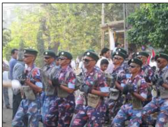
NCC Cadets performing the Skit Demonstrating the War Field during the Republic Day