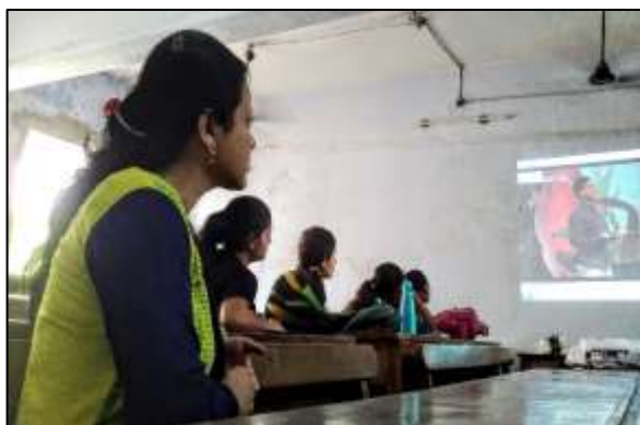
Teachers & Students During the 'Expressions' Program