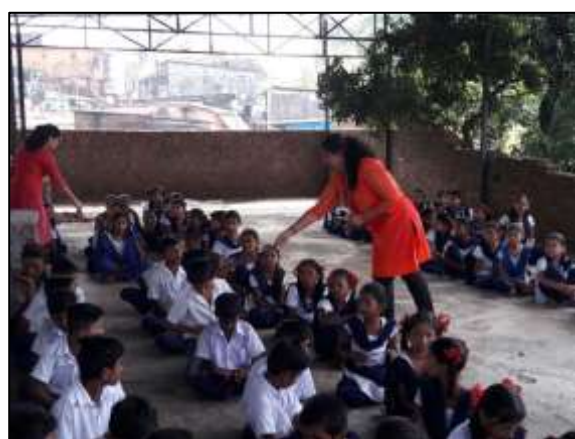
Extension Students Working in the Sharada Vidyamandir, the School Adopted by the College