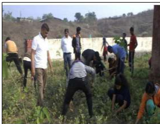
Program Officers & Volunteers During Cleanliness Drive