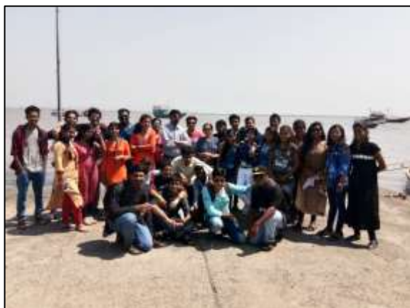
Departmental Field Visit to Vasai