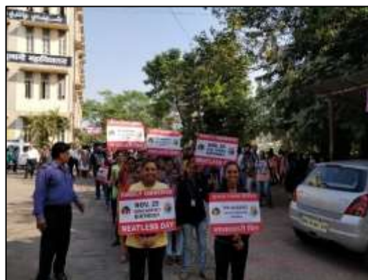
Students Participating in the Peace Rally