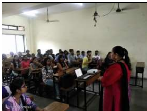
Expert lecture on “Career opportunities in IT” by SEED Infotech, Mumbai