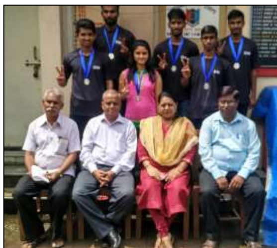
College Table Tennis Team that Won Silver Medal at University Level