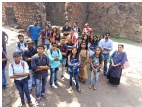
A moment in the Vasai Fort during the Departmental Field Visit