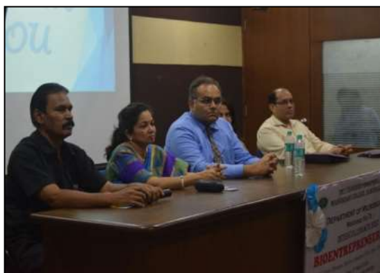
Dignitaries during the Event - BIOENTREPRENEUR 2018