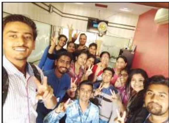
BMS@CHM on winning the Trophy of “Best Contingent” at HR College of Commerce & Economics