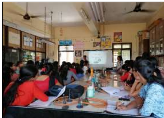
Seminar on Guidance for the Competitive Examinations