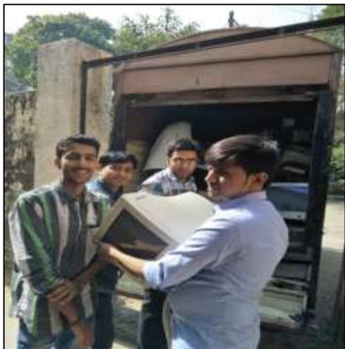
Non-Teaching Staff Helping the E-Waste Collection for its Eco-friendly Disposal