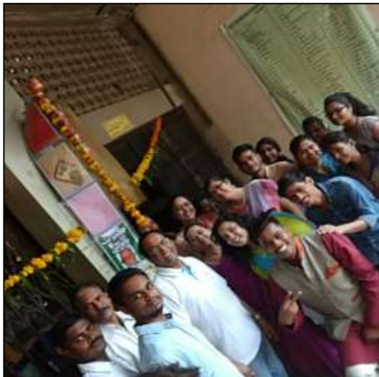
Department Faculty & Students during the Installation of the Pustak Gudhi