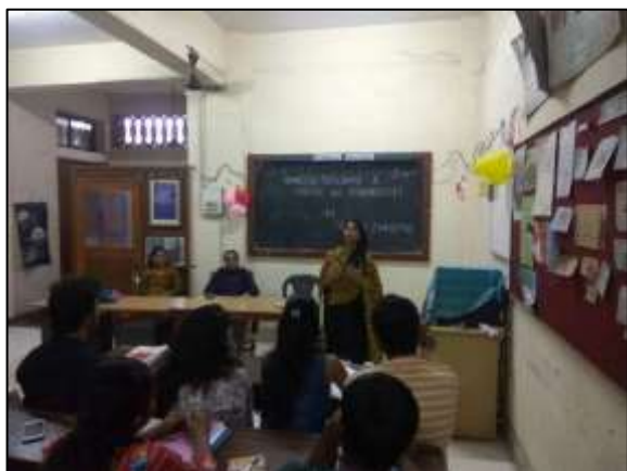
Talk on the relatively new topic “Shadow teaching”