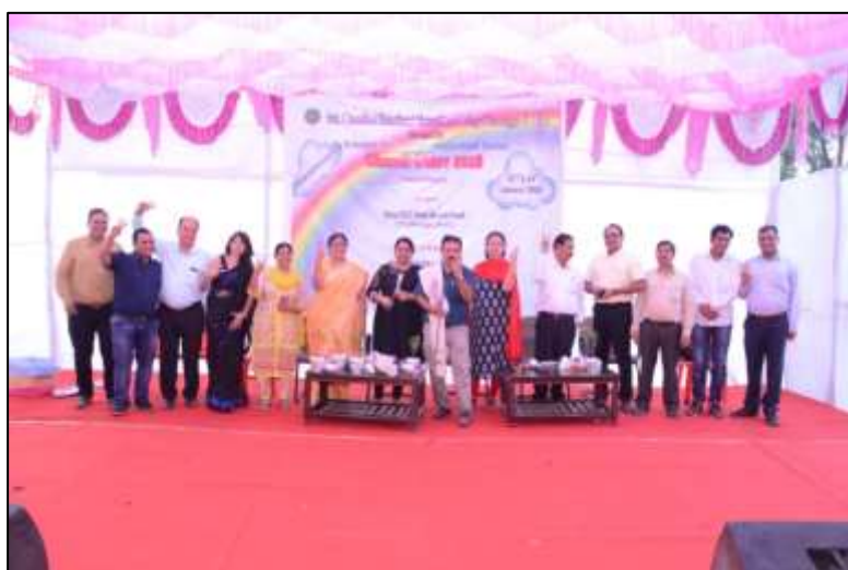
Felicitation of Teachers during the Chandi Utsav