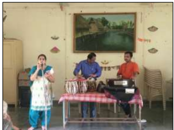
Alumni of the Department Performing at Shantivan, Nere near Karjat