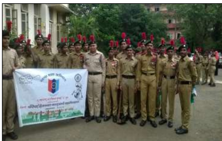
NCC Cadets During the Swachh Bharat Abhiyan Activity in the College