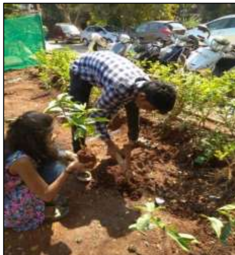
Students Engaged in the Tree Plantation in the Butterfly Garden of the College Campus