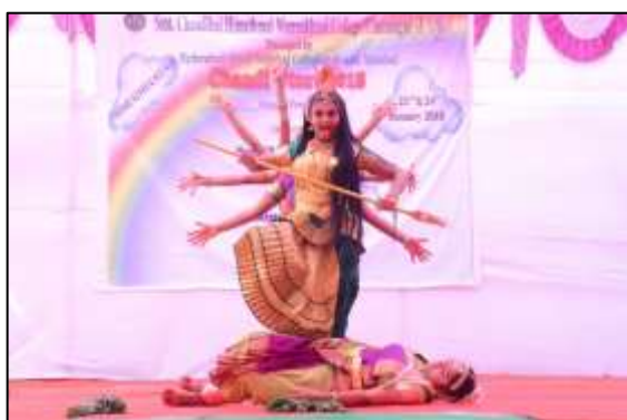
A Student Performing Dance during the Chandi Utsav