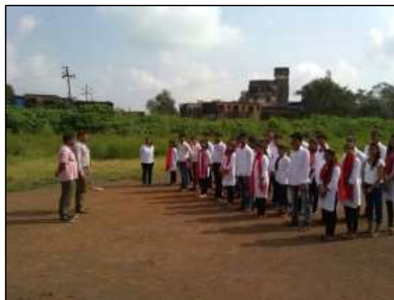
A Moment During the NSS Foundation Day