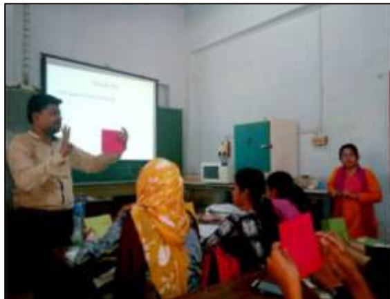
Interdisciplinary Seminar for PG Students