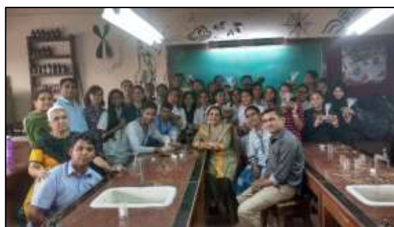
Participants & Faculty of the Department