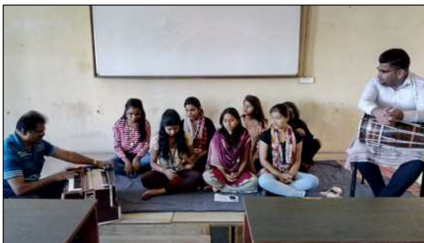
Students Rehearsing for Bhajans Prabhat