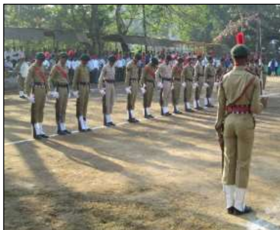
NCC Cadets during the Republic Day Parade