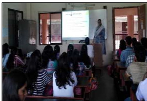
Lecture by the SEED Infotech