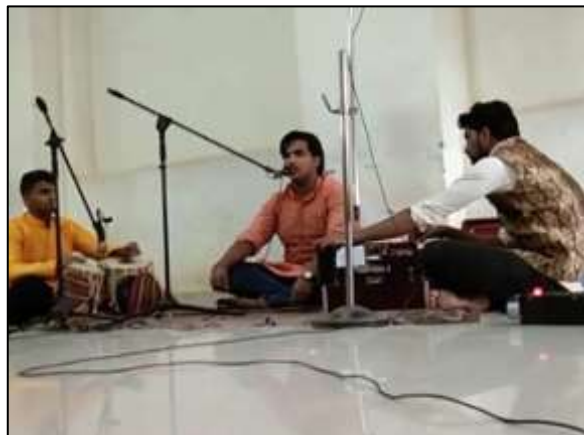
Students Performing Indian Classical Solo During Youth Festival