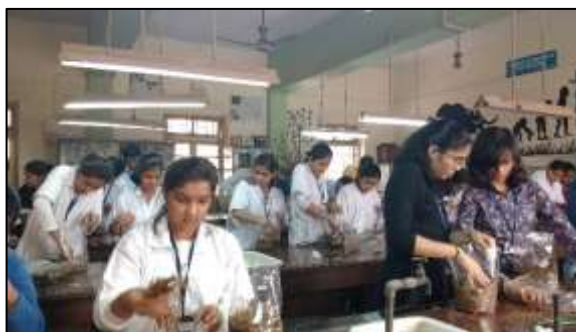
Participants Preparing their Mushroom Beds in the Workshop on Mushroom Cultivation