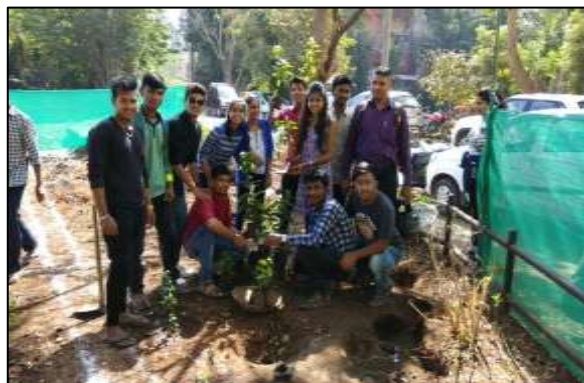
A Moment During the Tree Plantation for the Butterfly Garden