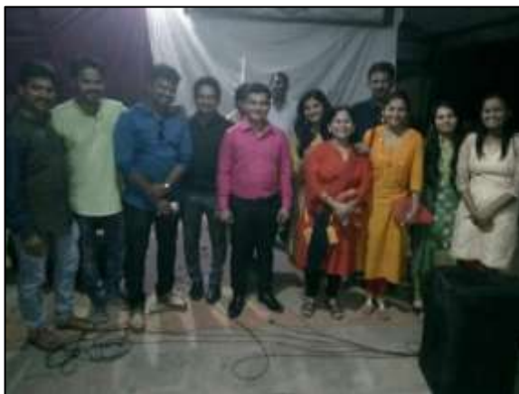
Students & Alumni of the Department during the Visit to Shantivan at Nere near Karjat