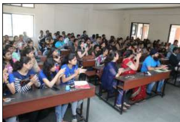
Students, Faculty & Guests Appreciating the Short Film made by SYBMM students on Ragging