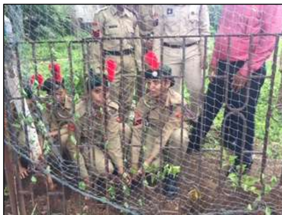
NCC Cadets Holding Saplings to be Planted in the College Campus During the Tree Plantation Activity