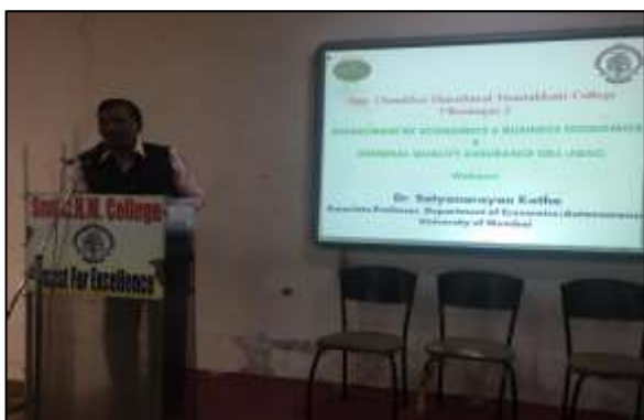
Workshop on Research Methodology