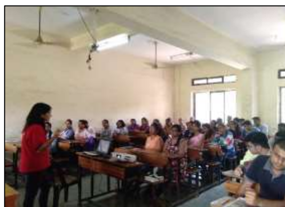
Expert Lecture on “Emerging Technologies in IT as a Software Tester” by SQUAD Infotech Pvt. Lt, Mumbai