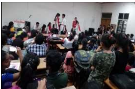
First Prize Winning Skit Performed During 'Expressions' on the theme "What is your 'Yes' and what is your 'No'?"