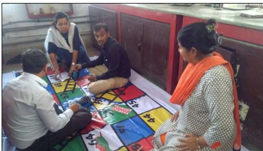
Department Faculty Busy in the Preparation of the ChemFest