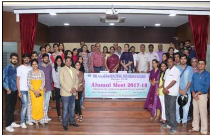
A Moment During the Alumni Meet