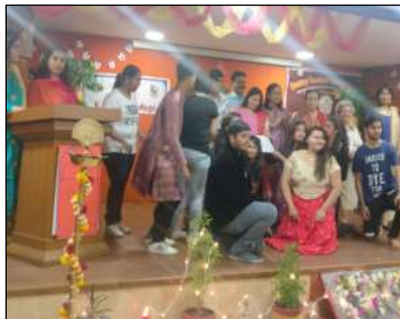
Students Performing during "Sindhiyat Ji Surhan"