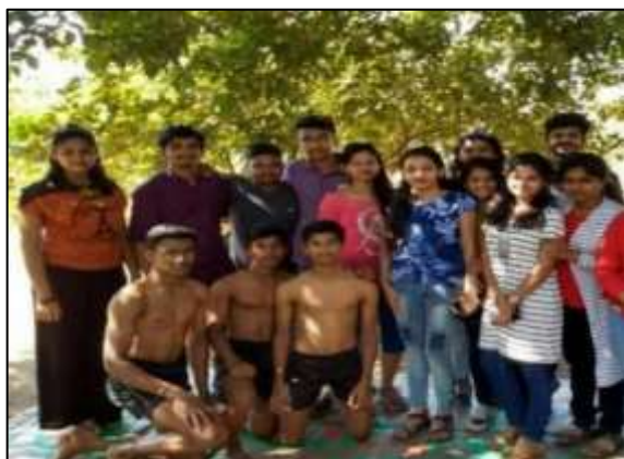
Group of SYBSc Students with Malkhamb Boys during the Visit to Saguna Bag