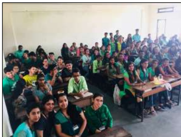
Department of Management Studies celebrating Green Day