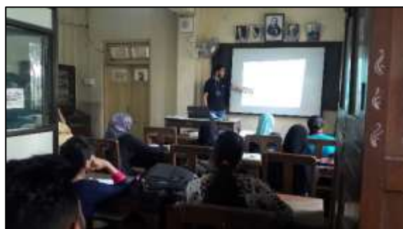
TYBA Student Giving Presentation on Geopolitics of the Indian Ocean