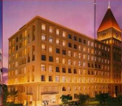
CHM NEW BUILDING